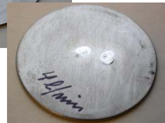
Test disc displaying optimum purge gas

Tint Tester is designed to test the gas purity at the welding site. The degree of discolouration also depends on a number of other factors. Examples of such could be surface cleanliness and welding parameter variations.