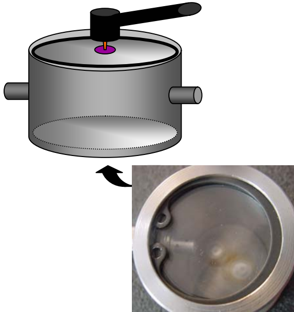
The Tint Tester principle