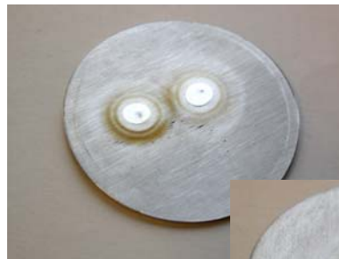
Test disc where the purge gas was not sufficiently clean

The test discs are serial numbered, which makes them traceable.