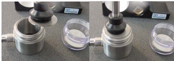
To ensure a better quality on the result, handling of the test discs is without touch

As the purging time in the chamber is approximately 5 seconds, gas consumption as well as waiting time for the welder are reduced.